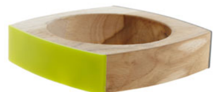
Fashion trends for spring