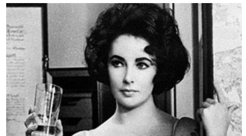
Fashion icon Elizabeth Taylor's style