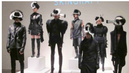
Los Angeles Fashion Week | Photos