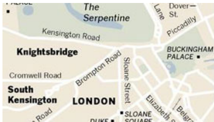
Kate Middleton's London